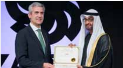
ABB won Zayed Future Energy Prize 2014

ABB, the global power and automation technology group, has been awarded the Zayed Future Energy Prize 2014 in recognition of its efforts to drive innovation, renewable energy and energy